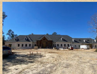
Money Hill Parkway