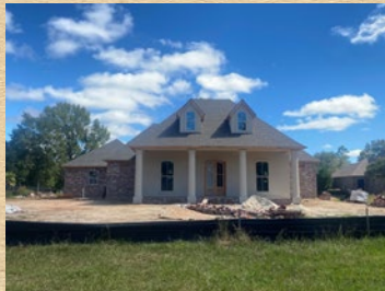
Great Southern Drive